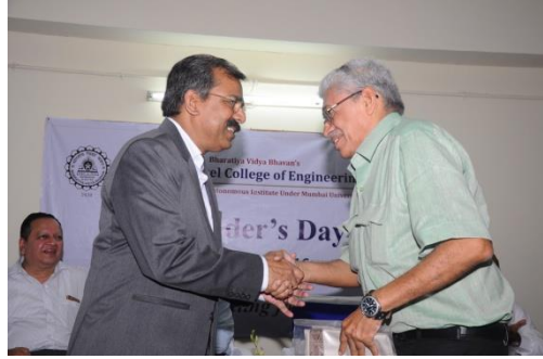
Former heads of the department were felicitated