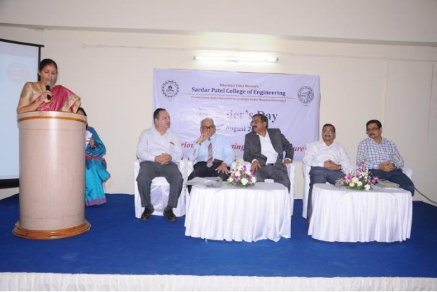
After vote of thanks everyone proceeded for dinner. .